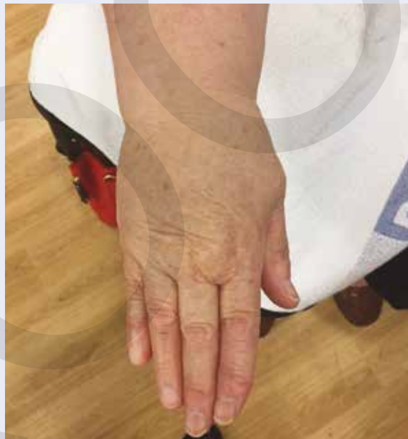
Fig 4. The limb after 3 months' therapy: the size and shape of the limb had improved, as had the appearance of the fibrotic tissues, especially on the hand and forearm

At the 3-month follow-up, the circumferential measurements had reduced by 1.5–2 cm at various points along the limb. The tissues were softer and the limb function and movement were much improved ( Figure 4 ).