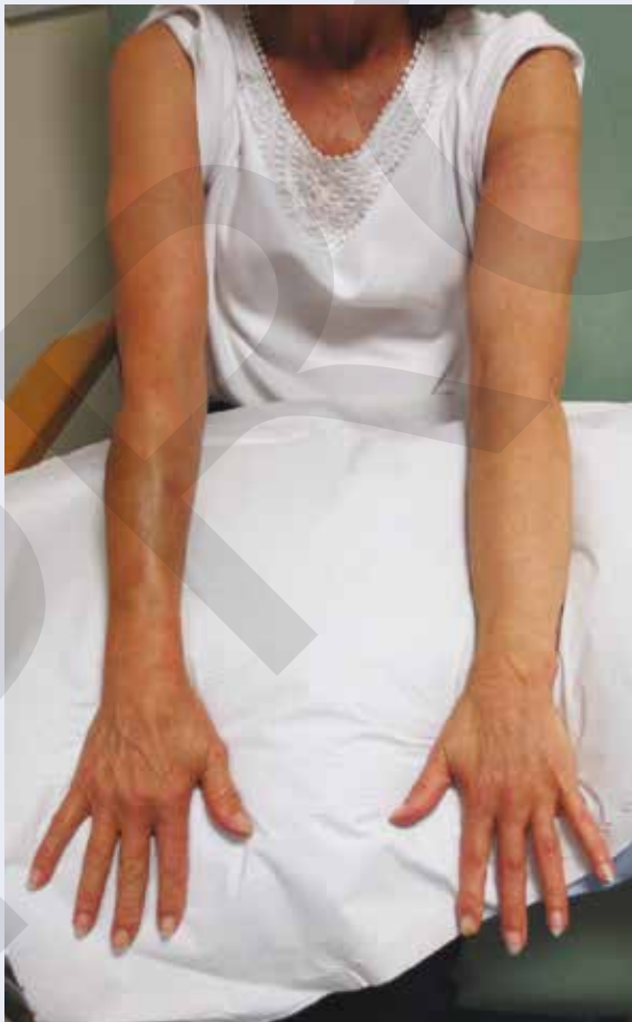
Fig 1. The patient's arms on the first day of therapy with JOBST Relax

The patient's history of lymphoedema dated back to 2011 when she developed the condition in her left