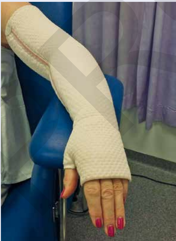
Fig 1. JOBST Relax in place at one-week follow-up

Decongestive lymphatic therapy (DLT) comprises skin care, exercise, MLD and reduction/reshaping of the limb, usually using multilayer lymphoedema bandaging. This intensive treatment typically lasts for 2–4 weeks and requires frequent visits to a clinic. Due to personal circumstances and family commitments, which involved caring for her mother with dementia and supporting her daughter who had a young baby, the patient declined