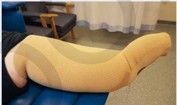
Fig 1. JOBST Relax in place

After one week, the volume of oedema in his left lower leg had reduced ( Table 1 ). It continued to reduce for 4–6