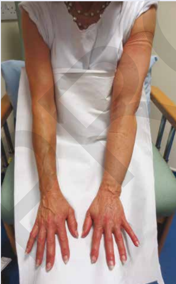
Fig 3. The patient's arms on the 10th day of therapy with JOBST Relax

Between February 2016 and 6 April 2016, following daily wear of a ready-to-wear, circular-knit compression class 2 (20–36 mmHg) glove and 20–30 mmHg wrap compression system armpiece, the volume of her arm reduced by 384 ml, with the excess limb volume decreasing from 114% to 89%. However, at the next review 3 weeks later, this had increased by 399 ml, increasing the excess volume to 111%.