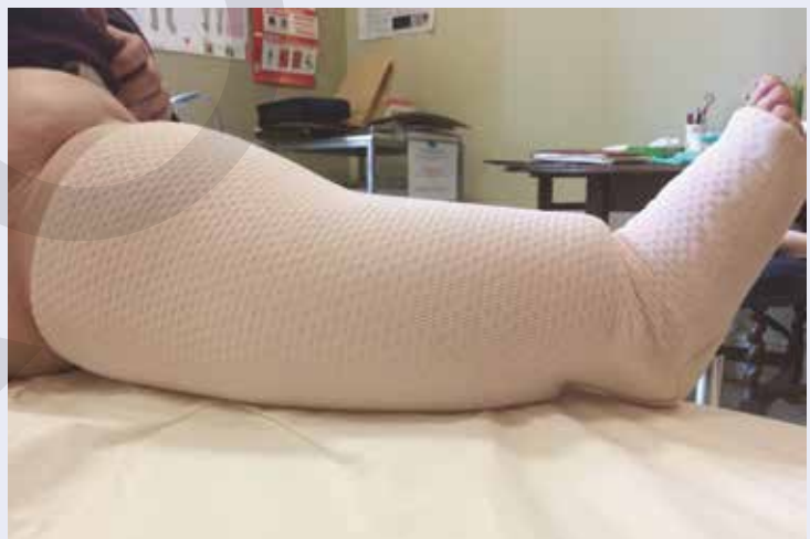
Fig 3. The limb with the JOBST Relax garment in place

Based on this case, the lymphoedema service will consider using JOBST Relax to increase the reduction in limb size immediately after DLT.