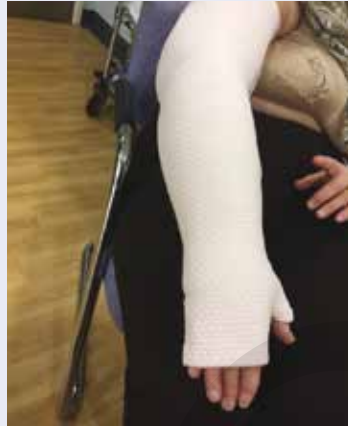
Fig 2. JOBST Relax fitted and in place

'I now feel back in control of my lymphoedema, rather than the other way round!'