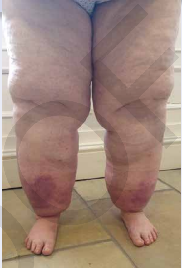
Fig 2. The patient's legs after 10 sessions of decongestive lymphatic therapy

therapy, manual lymphatic drainage (MLD) with a hand-held negative pressure wound therapy device and multilayer lymphoedema bandaging (Whitaker et al, 2015). Over the course of DLT, the limb volume in her right leg reduced from 10244 ml to 6347 ml and she lost 21 kg in weight, with her BMI reducing to 48 (Figure 2). After this, she received monthly treatments of MLD and self-managed with custom-fit, flat-knit, RAL compression class 3 (34–46 mmHg) graduated compression tights and a below-knee wrap compression system, which she wore all day until bedtime.