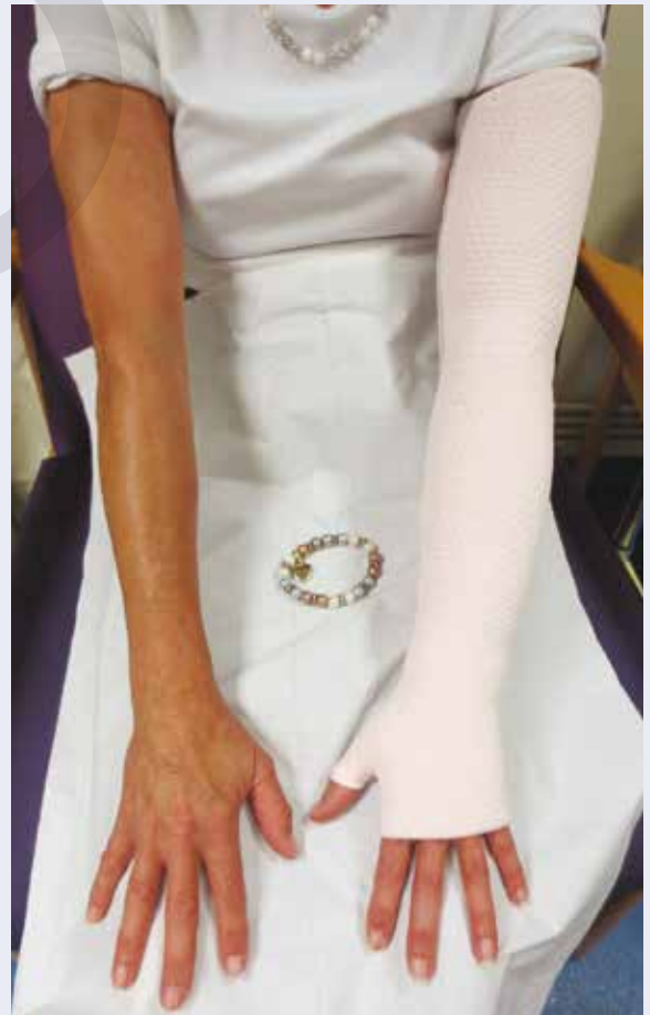
Fig 2. JOBST Relax in place