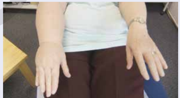
Fig 1. The limb before JOBST Relax was first used

To overcome these issues, a ready-to-wear, short-stretch wrap compression system (20–30 mmHg), which is useful for patients with fluctuating/rebound oedema