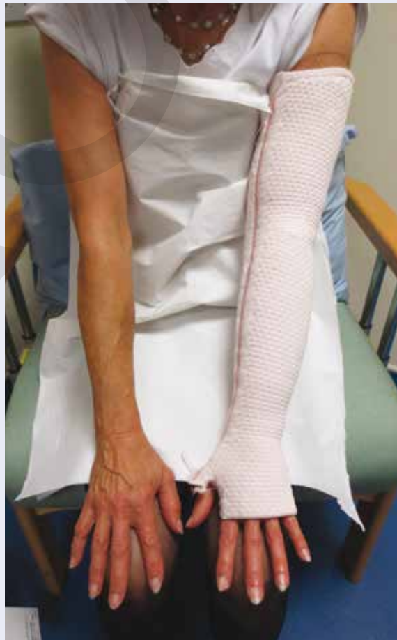
Fig 4. JOBST Relax in place after 10 days of therapy