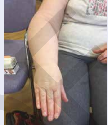
Fig 3. The limb after one month's therapy with JOBST Relax