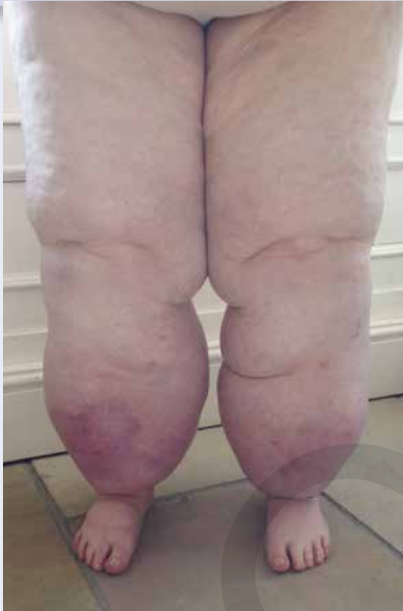
Fig 1. The patient's legs before decongestive lymphatic therapy was undertaken in 2014