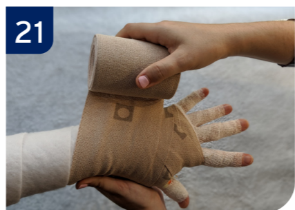
21 Compri2 Compression Layer: Arm Overlap hand compression with a loose anchor. Compress up the limb.