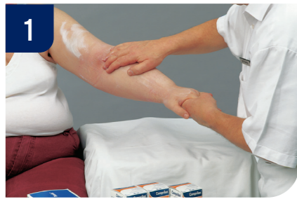
1 Before applying the bandages, ensure good skin care has taken place.