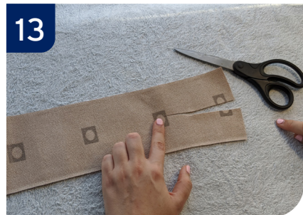
13 Compri2 Compression Layer: Hand Cut a piece of the compression layer that is approximately 8 indicator squares long. Cut to one indicator square from one end.