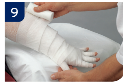
9 Bandage up the limb with 50% overlapping turns.