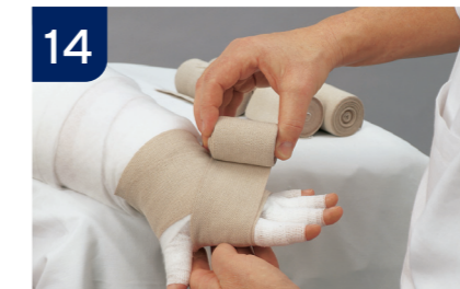
14 The turns run from the back of the hand to the palm, returning to the back of the hand.