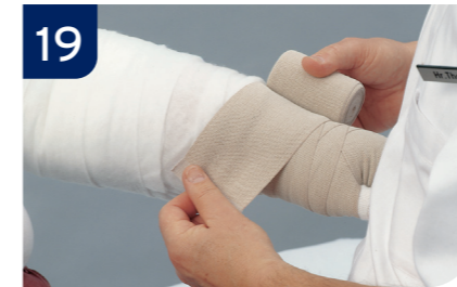
19 The patient presses a clenched fist against the therapist's abdomen and tenses their muscles. 8 cm Comprilan® is started from the wrist.