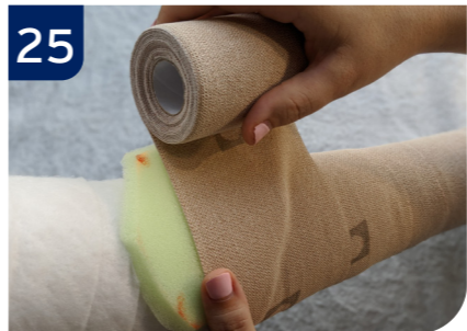
25 Elbow pad is recommended especially for the first application.