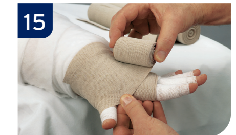
15 After one turn across the middle phalanx of the thumb, hold the edge of the bandage down.