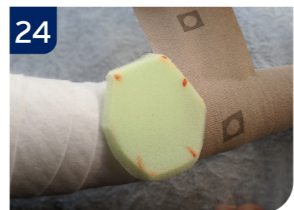
24 Insert elbow pad (optional).