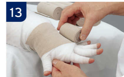
13 Start the 6 cm Comprilan® compression bandaging with an anchor at the wrist.