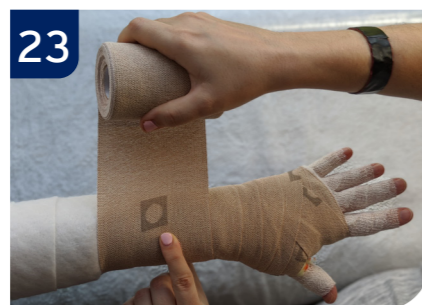
23 Maintain the correct tension during application to ensure even compression.