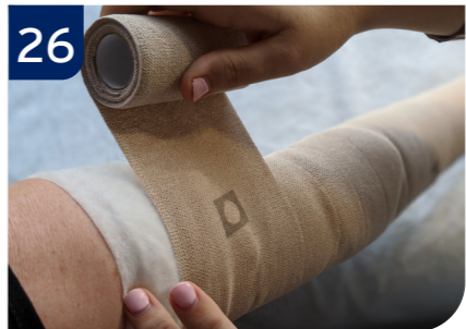
26 Finish two fingers from the axillary fold.