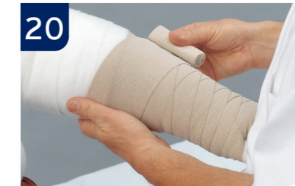
20 Run in long figures of eight or spirals, using 50% overlap, up to the elbow.