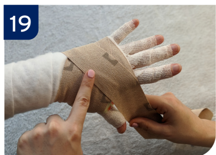
19 Apply a second layer to ensure optimal stiffness is created over the dorsum of the hand.