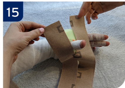
15 Drape over the hand. Apply the first "strap" over the dorsum of the hand.