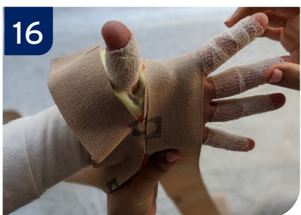
16 Drape and apply the more distal strap first, followed by the more proximal strap second.