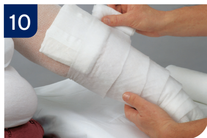
10 Additional padding may be added for extra protection.