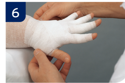
6 Secure each finger bandage with an anchor around the back of the hand.