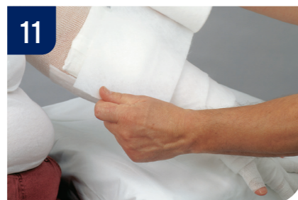
11 Continue applying padding up the limb. It is recommended that a wider size padding is used beyond the forearm.