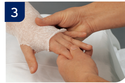
3 Apply the Protouch® Stockinette to the length of the arm, allowing a small hole for the thumb.