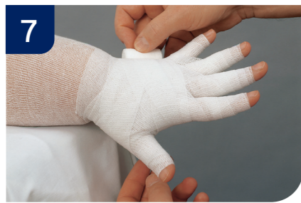
7 The completed finger bandages should be on the dorsum of the hand, leaving the palm free.