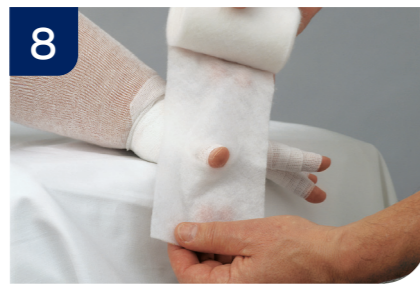
8 Pad the limb with Artiflex®, starting at the base of the metacarpal heads and leaving a hole for the thumb.