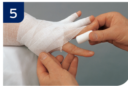
5 Coming from the wrist, make approximately two turns around the finger with light tension before returning over the back of the hand. Ensure you leave the finger tips free.