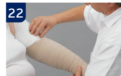
22 Secure the end of the bandage with adhesive tape and roll over the Protouch® Stockinette for protection.