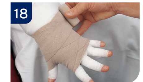
18 After two turns around the hand, the first Comprilan® bandage should end two figures of eight just behind the wrist.