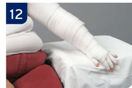
12 Continue the padding up to the armpit.