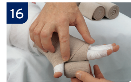
16 To prevent pocketing between the thumb and index finger, press down the edge of the previous turn.