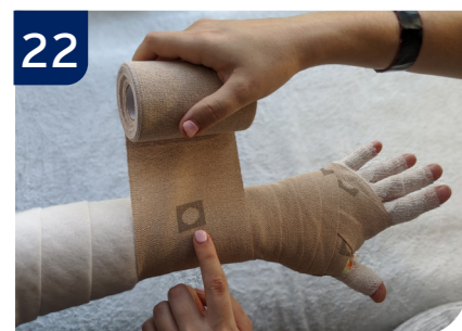
22 To achieve correct pressure, pull from oval to square on the pressure indicator.