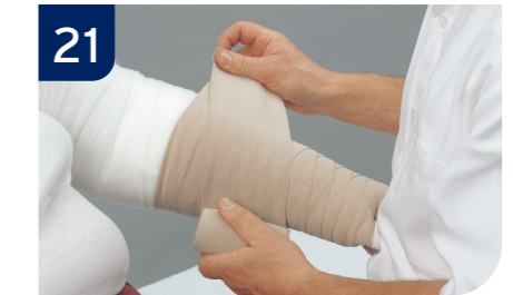
21 Start a new 10 cm Comprilan® and commencing in the opposite direction, in figures of eight or spirals, wrap up the limb, over the elbow and up to the upper arm.