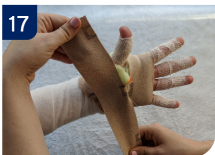
17 Use the second strap over the dorsum and the thenar eminence area. Wrap in a figure 8 pattern to encompass the base of the thumb.