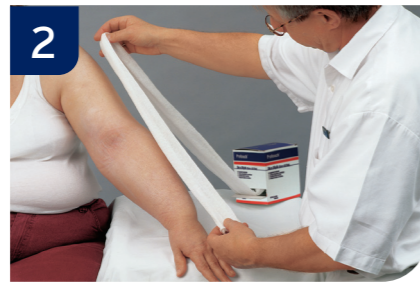
2 Measure the Protouch® Stockinette to be used as protection by measuring the length of the total arm from fingers to shoulder tip.