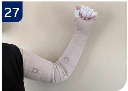
27 Test function and comfort and provide safety warnings.