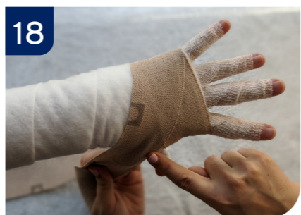
18 Once the hand has been encompassed, continue up to the wrist.