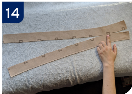
14 Cut from the opposite end lengthwise, leaving a 2 cm region uncut.