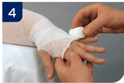
4 To bandage the fingers, start an anchor at the wrist with a gauze bandage.