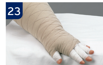
23 Ensure there are no gaps in the bandages to ensure no fluid accumulates in any area not compressed with bandage.