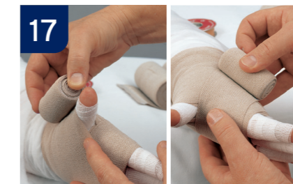
17 Repeat this turn once more.