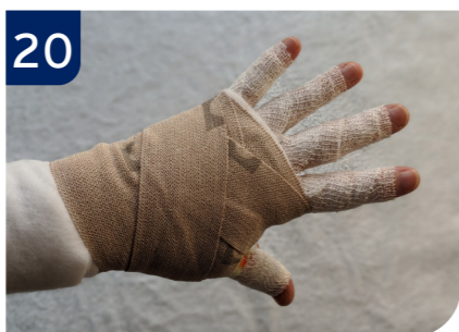
20 The individual length should be able to complete two rotations around the hand.