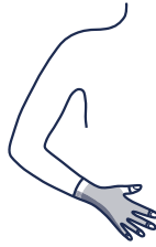
Glove with thumb and fingers to wrist AC1