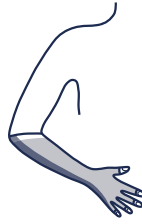
Glove or gauntlet with thumb to elbow. Available with or without bias top. AE